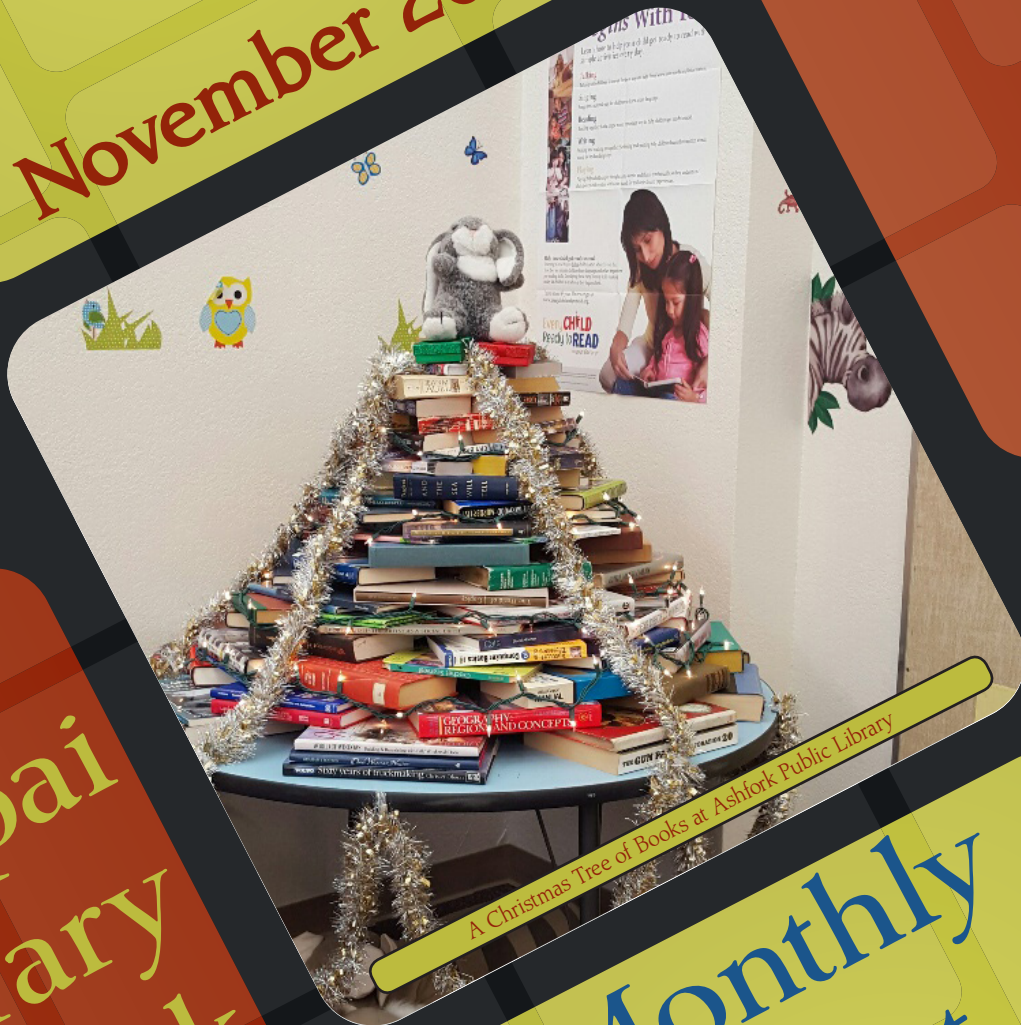
A Christmas Tree of Books at Ashfork Public Library