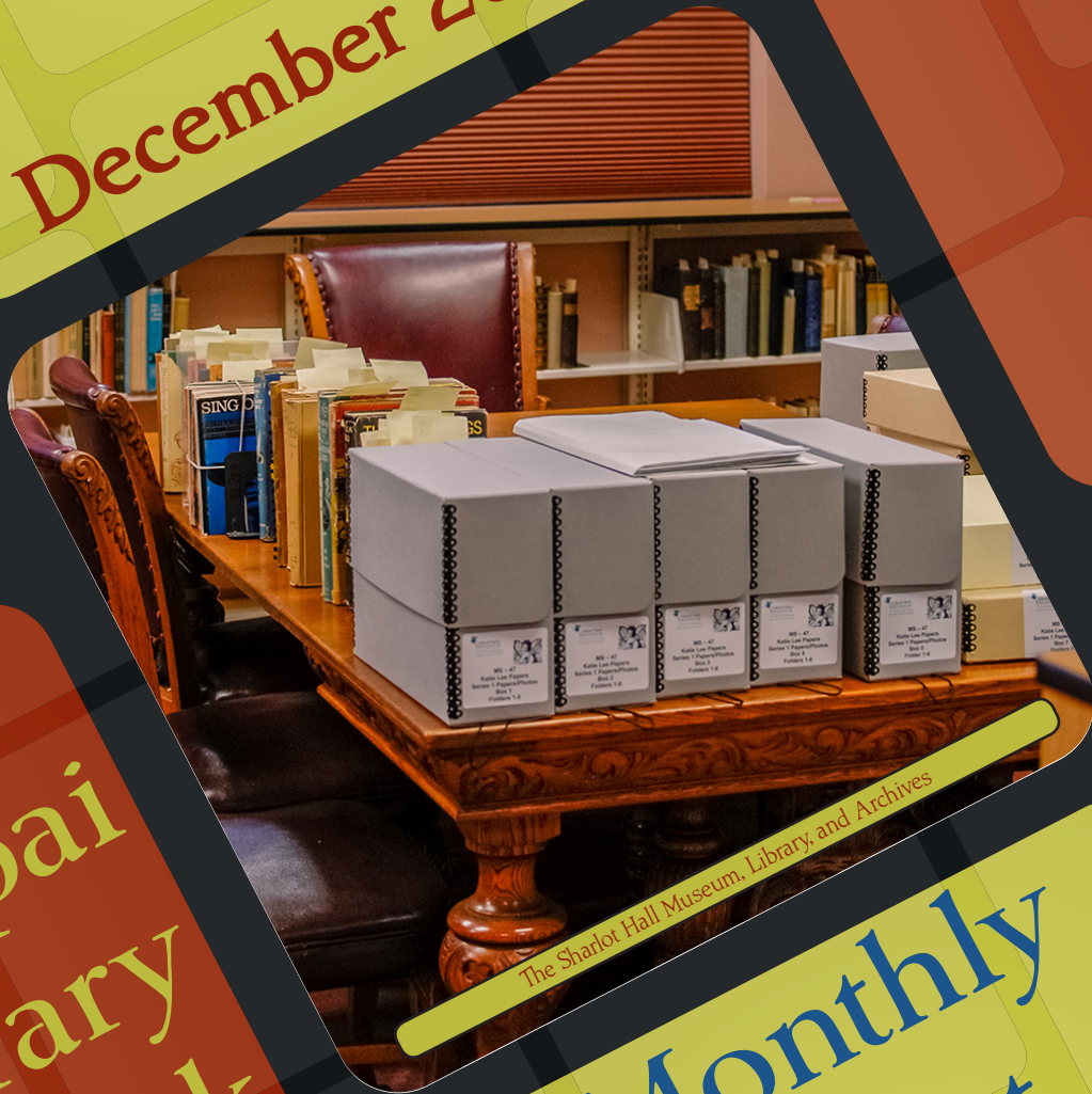
The Sharlot Hall Museum, Library, and Archives