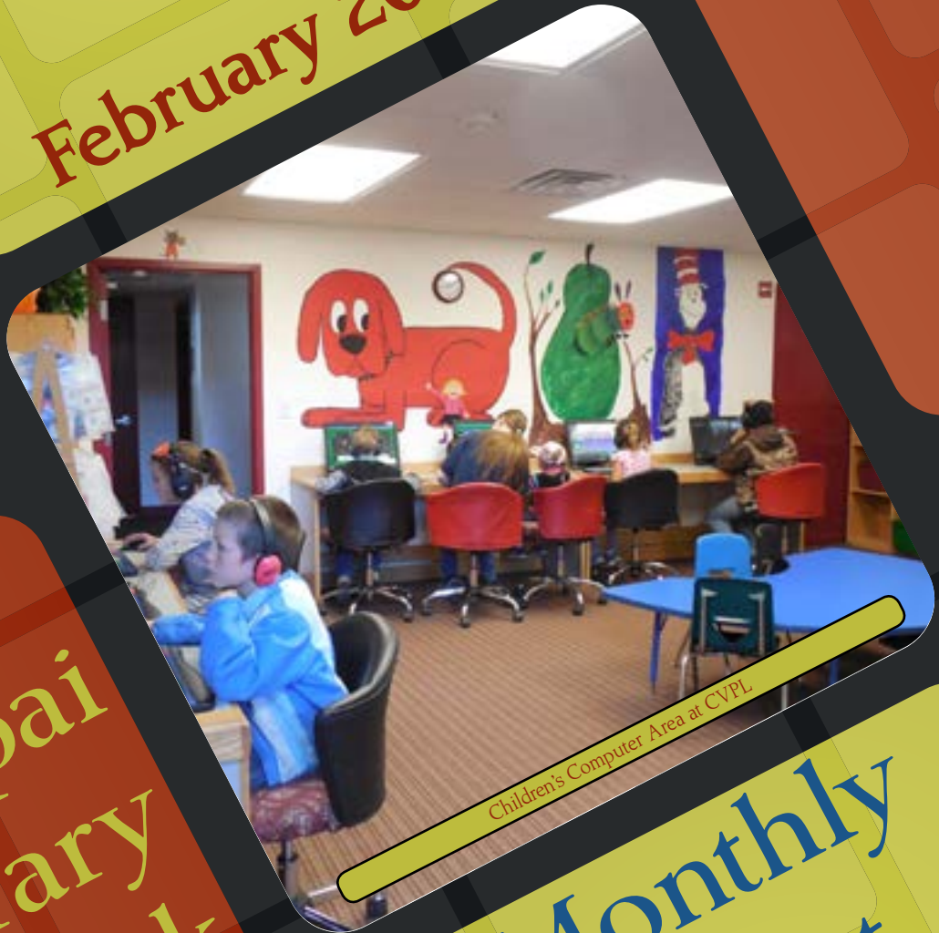
Children's Computer Area at CVPL