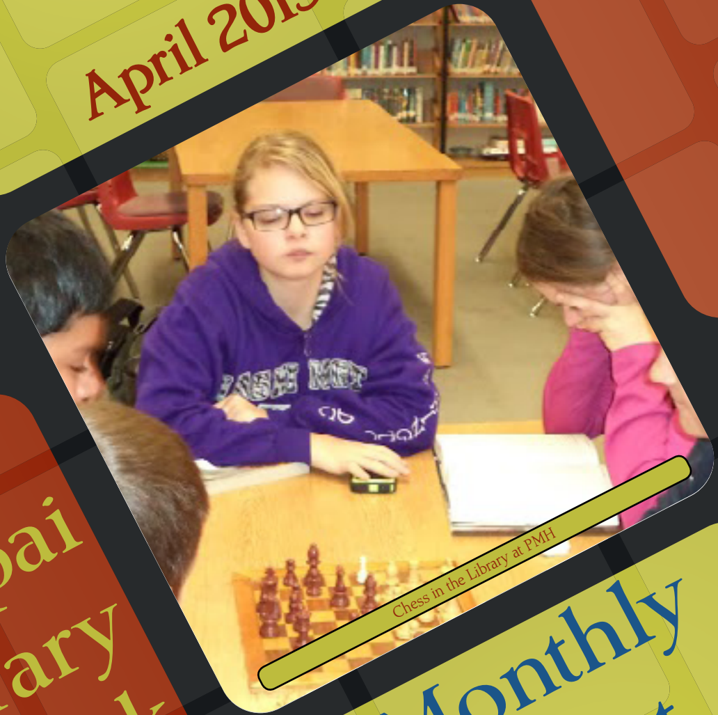
Chess in the Library at PMH