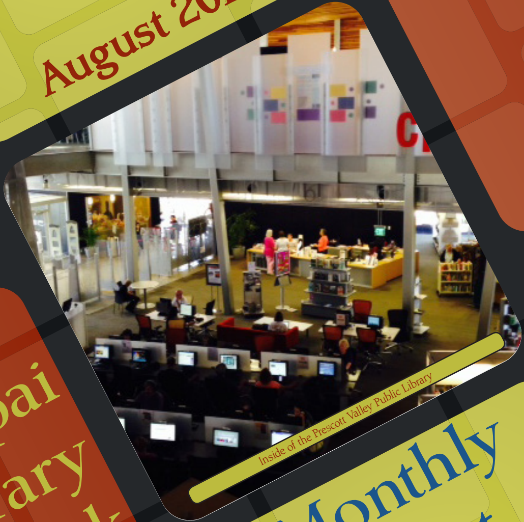
Inside of the Prescott Valley Public Library