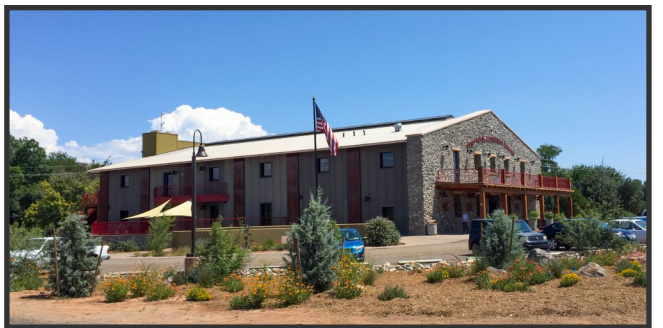
The new Camp Verde Community Library