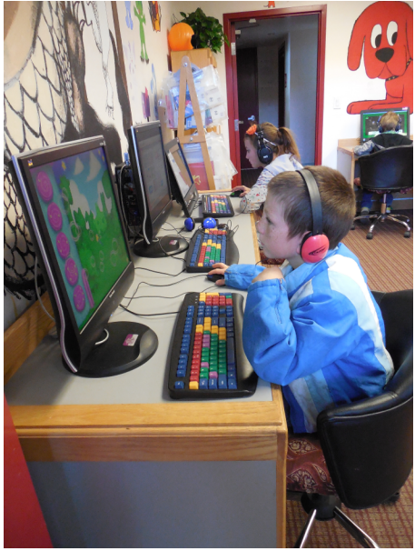
Chino Valley Public Library