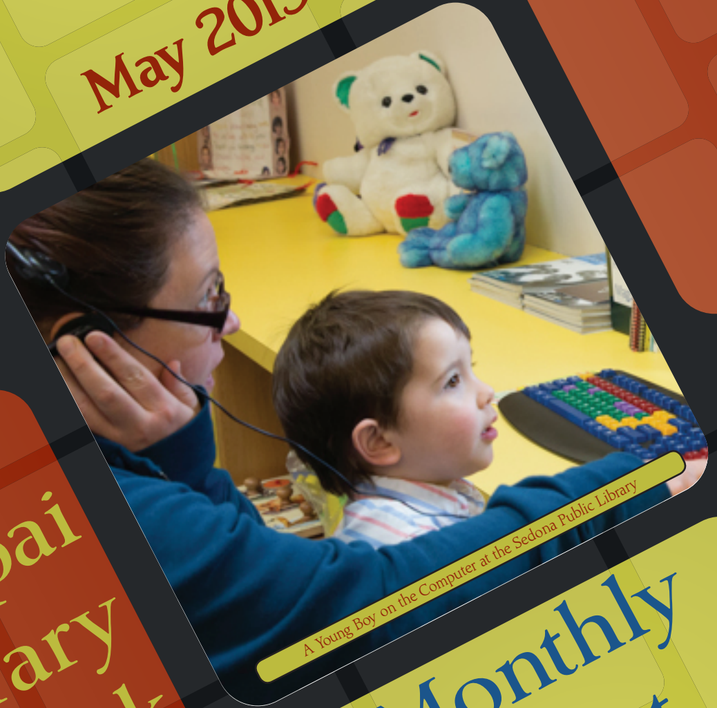
A Young Boy on the Computer at the Sedona Public Library