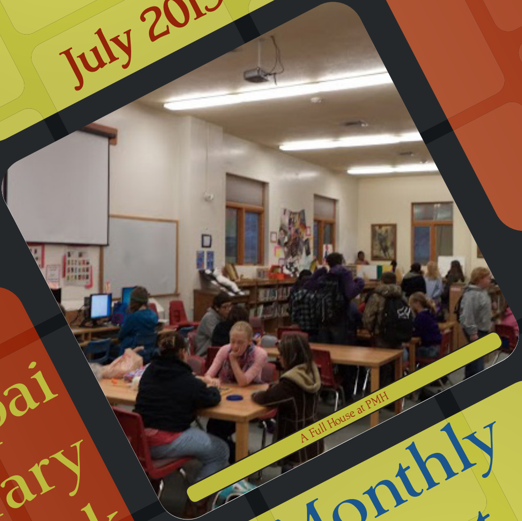
A Full House at PMH